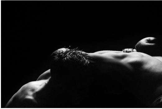
Neutral Corner, 1962.

His photographs provide a vivid account of life in Spain, focusing on the rural world, work and leisure, traditional fiestas and rituals, and the urban landscape and its cultural and religious facets.