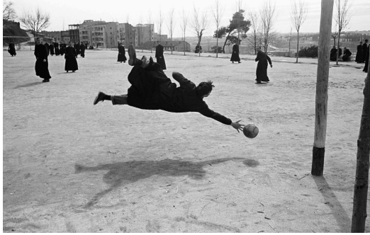
Seminario, Madrid, 1960.

“The photographs of Ramón Masats are a profound, complex and elegant account of Spain and its people in cultural and political transition.